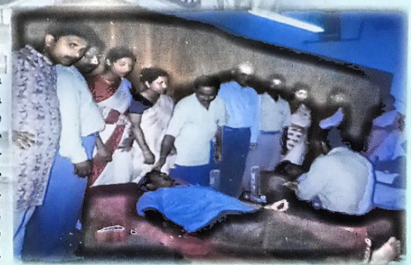
Blood donation Camp on the the college Foundation Day

The College also arranges functions to observe the birth anniversary of Rabindra Nath Tagore. The College Foundation Day is enthusiastically observed on 27th February through Blood Donation camp every year where students, teachers and eminent educationalists usually participate. Cultural competitions are held in which large number of students participate. Also, seminars and debates on various contemporary and important topics are organised on a regular basis.