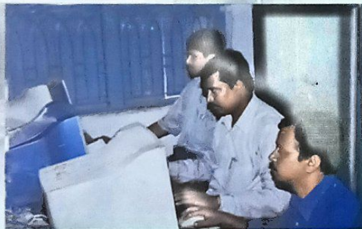
The Computer department at work

Knowledge has become essential in this world of information technology. The college will provide a computer package in collaboration with WEBEL Informatics Ltd. (a Govt. of West Bengal undertaking) at a