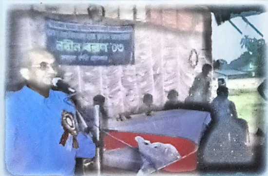
The Principal addressing the students during the Freshers' Welcome.

The college publishes an annual magazine, named PADAKSHEP. It contains a rich collection of poems, short stories, articles contributed by teachers and students alike. The students' Union plays a big role in seeing through its publication.