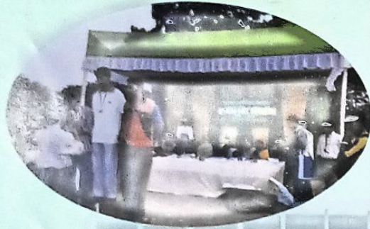
Prize distribution at Annual Sports Competition

institution, being a co-educational one, there are both Girls' and Boys' Common Rooms equipped with facilities of indoor games.