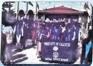
NSS Special Camp, 2014

College property, laboratory equipment, furniture, library books etc. must be treated with due care. Students are not permitted to smoke in the college campus. Impersonation at roll call is an offence. The principal has authority to impose fines or other appropriated punishment and in extreme cases may suspend or expel an offender.