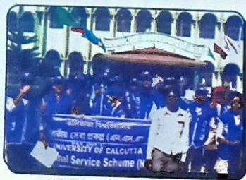
NSS Special Camp

A fully equipped Multi-Gym has become functional within the premises of Bhangar Mahavidyalaya. The Centre is open to students of the College, members of the Alumni Association and also the youth from the locality can avail the facility all at a nominal fees.