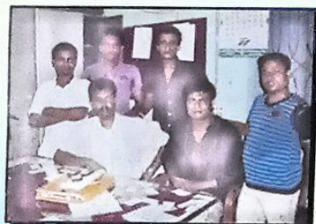
Non Teaching Staff.

BLIS: ( Bachelor of Library & Information Science) 1 Year duration.