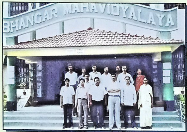
The Non- teaching staff