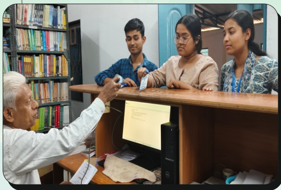
Library and Library staff

College property, laboratory equipment, furniture, library books etc. must be treated with due care. Students are not permitted to smoke in the college campus. Impersonation at roll call is an offence. The principal has authority to impose fines or other appropriated punishment and in extreme cases may suspend or expel an offender.