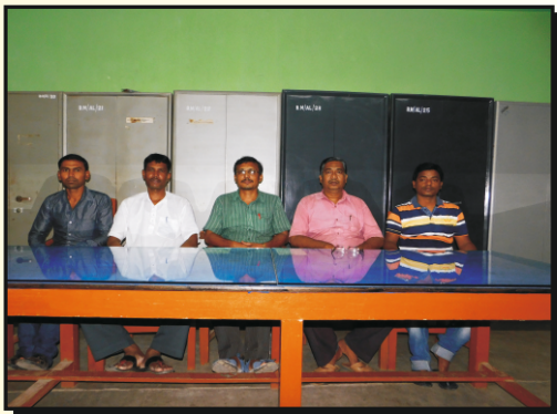
NSOU Co-ordinator & Staff

COURSE OFFERED : BPP: (Bachelor Preparatory Programme.) 6 Months duration