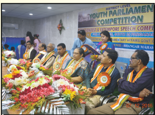
Youth Parliament in inaguration Programme

Inaguration Programme of the Youth Parliament Competition, (District Level) 24 Parganas South.