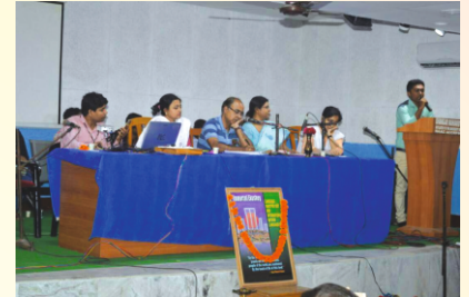
The Judges of Debate Competition in Bhasa Dibas

COURSE OFFERED : BPP: (Bachelor Preparatory Programme.) 6 Months duration