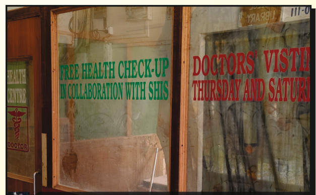
Health Camp (NSS) in Collaboration with IQAC