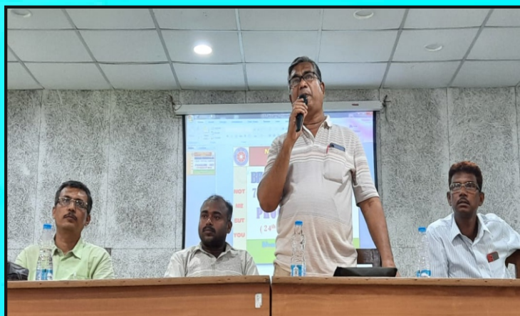
NSS Special Camp

The Department of Bengali had brought out an ISBN Book called 'Ebong Sahitya'. The Department of Bengali also had brought out its National Seminar Proceedings. The Department of English had brought out its seminar proceeding journal with ISBN number.