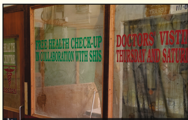
Health Camp (NSS) in Collaboration with IQAC