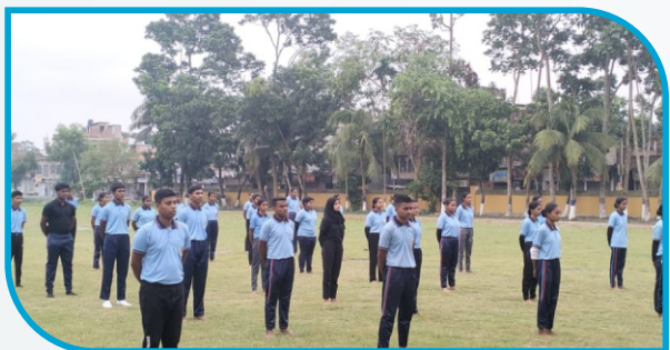
Yoga Day Celebration