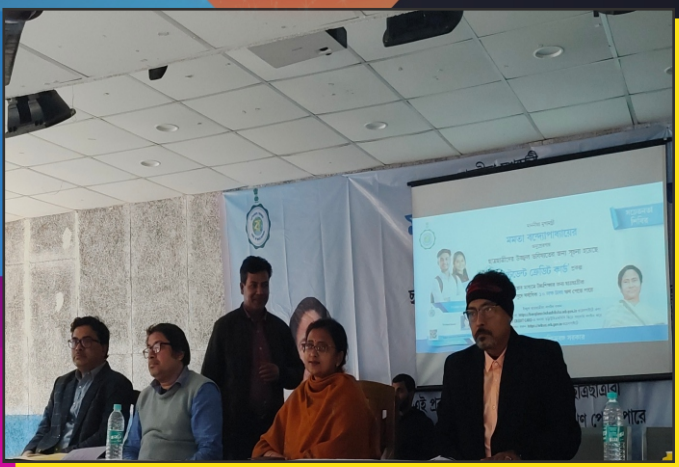
Students Credit Card