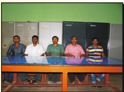
NSOU Co-ordinator & Staff

COURSE OFFERED : BPP: (Bachelor Preparatory Programme.) 6 Months duration